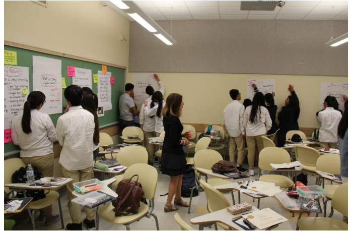
District and Chinese students participating in the Bay Area Writing Project program at U.C. Berkeley.