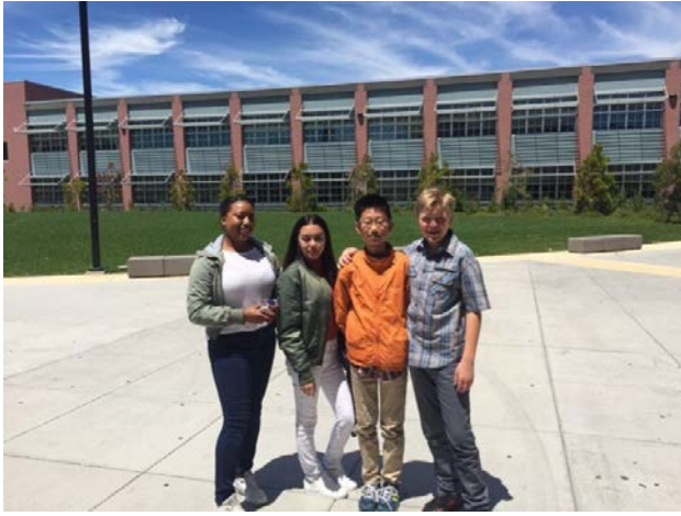
Local and Chinese students participating in cultural exchange activities and developing friendships