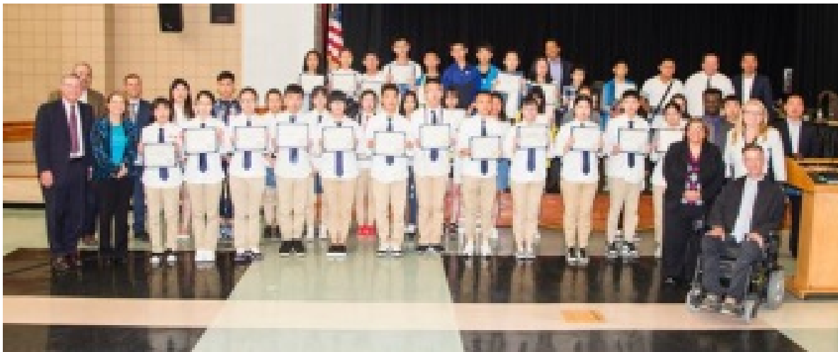
The WCCUSD Board and Cabinet recognize the first group of international students attending the summer program